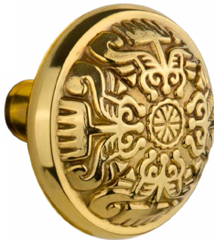
Eastlake Knob shown in Polished Brass